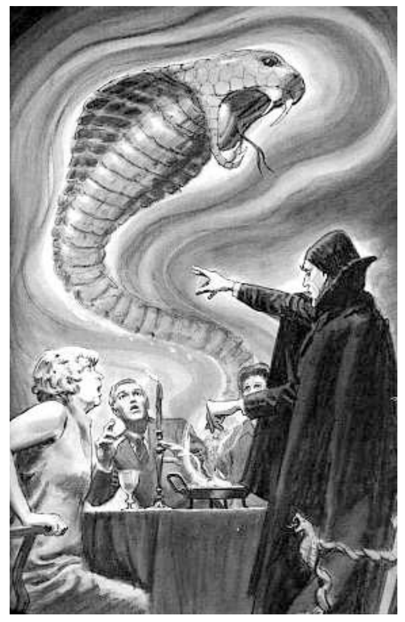
"Okay, Jupe, but watch it," said Bob. "I will," promised Jupiter.

"Go out the back, the way we came in. Make a disturbance. Climb the wall. Set off the alarm. Make them think they've scared everybody off. Then get to the car and tell Worthington I'll meet you at Sunset and Torrente as soon as I can."